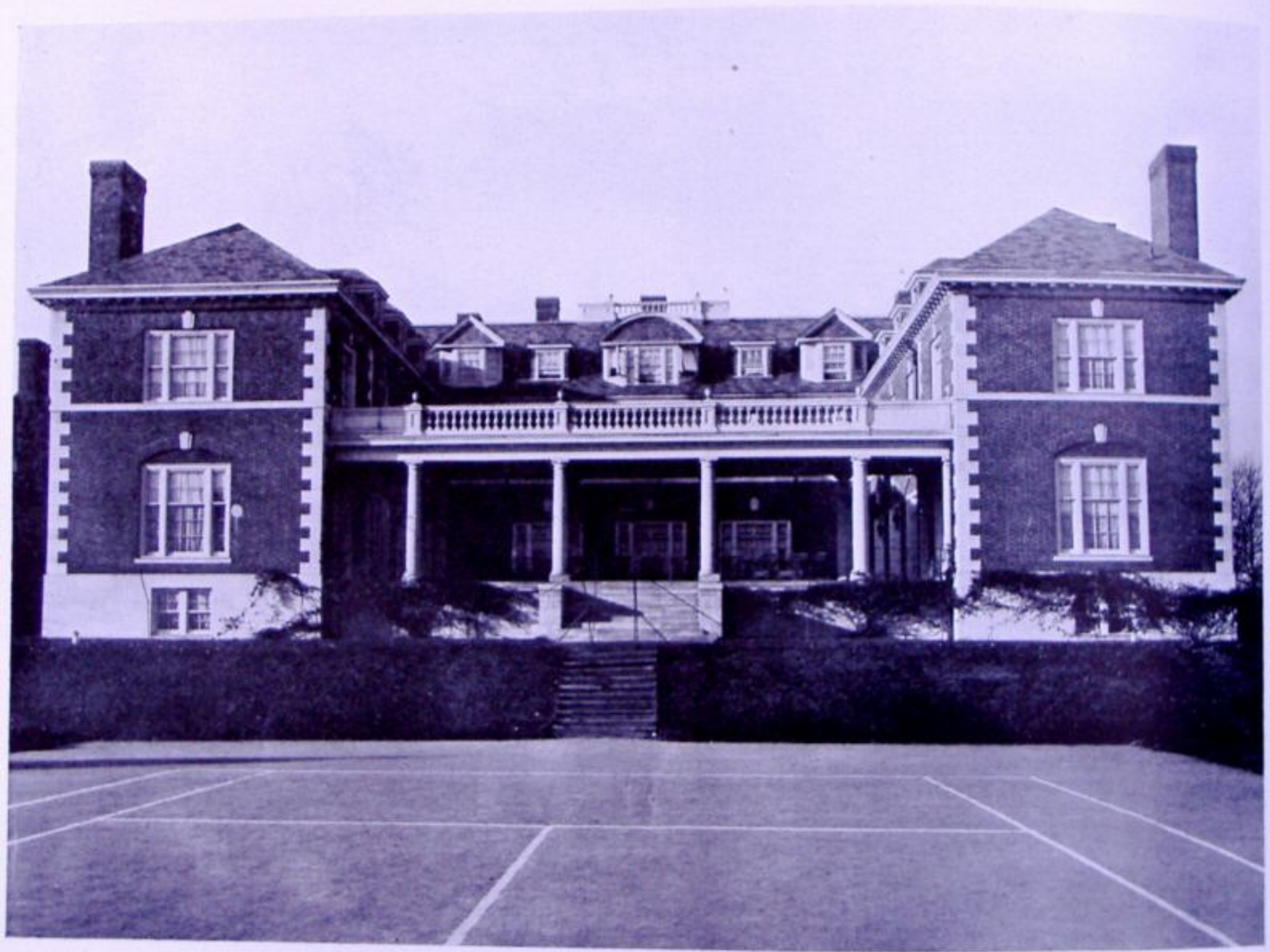
UNIVERSITY COTTAGE CLUB