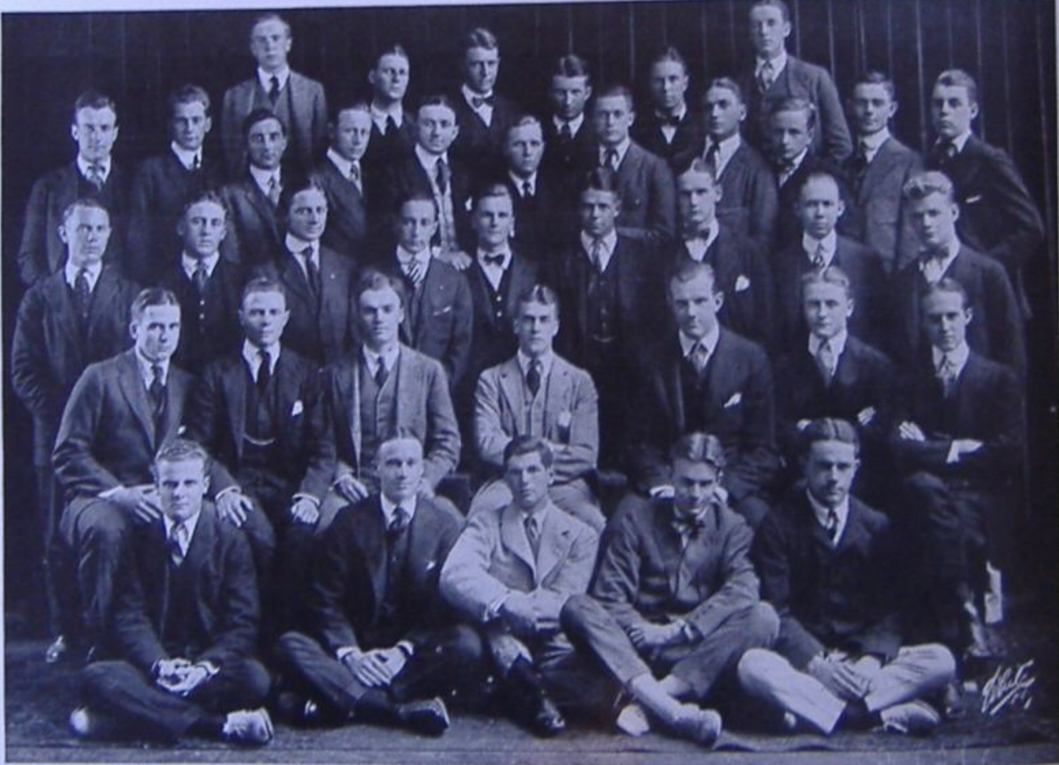
TRIANGLE CLUB, 1914-15